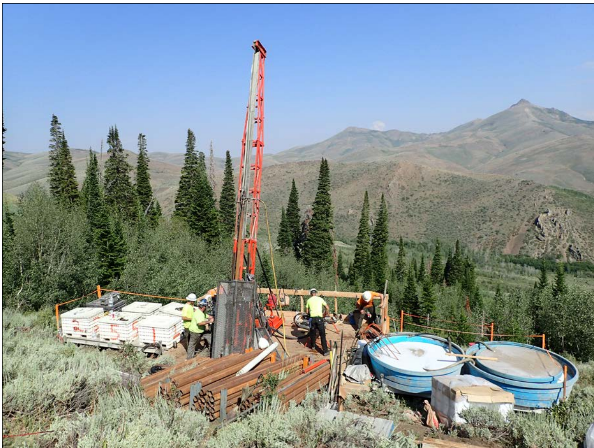
Figure 1: Drill rig at Beadles Creek

The drilling at Beadles Creek has been designed to test for shallow up-dip eastern extensions of the high grade zone intersected during the 2016 drilling campaign (Figure 2). A second drill rig will be mobilised to site shortly to commence drilling at South Sammy.