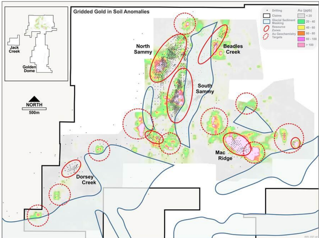
Figure 2: Gold in Soil Anomalies at Big Springs